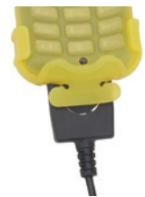
Integrated data cable port flip-lid