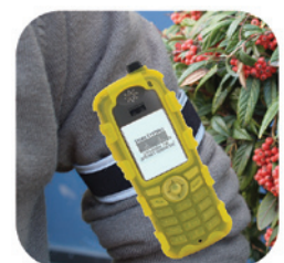
Compatible with zCover arm band