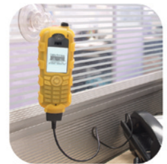
Compatible with zCover window clip