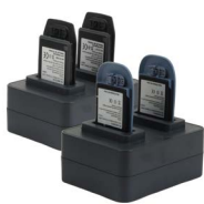
Unified 2 Batteries Charger