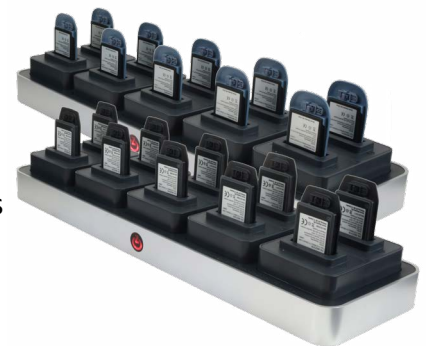
Compatible with ASCOM d81/d62/i62 handset battery