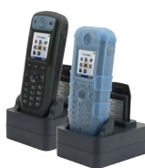
Unified Dual Charger Dock