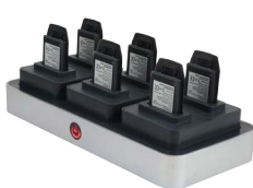
Unified 3 slots Multi-Charger