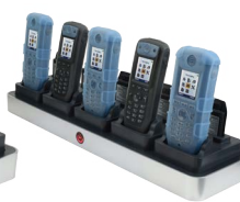
Unified 5 slots Multi-Charger