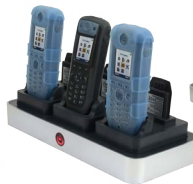
Unified 3 slots Multi-Charger