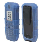
Back Open Ruggedized Silicone Case